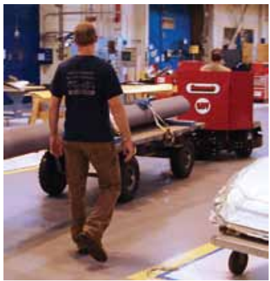
G-18 at Warner Robins