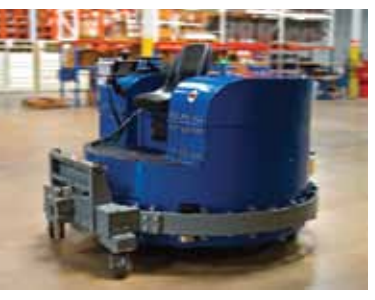
Boeing Electric ODV