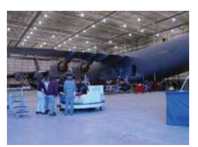
U.S. Air Force Aircraft Maintenance