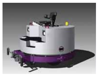
ODV Sorting Tractor