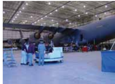
U.S. Air Force Aircraft Maintenance