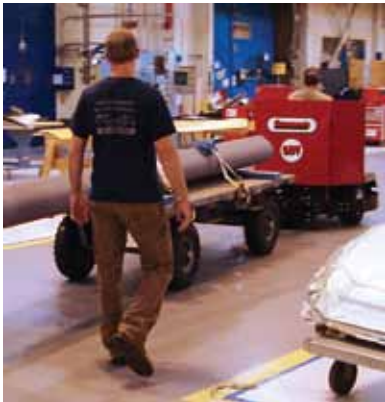
G-18 at Warner Robins