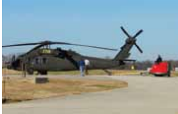
ODV G-60 towing Army helicopter