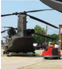
Towing Army helicopter