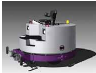
ODV Sorting Tractor