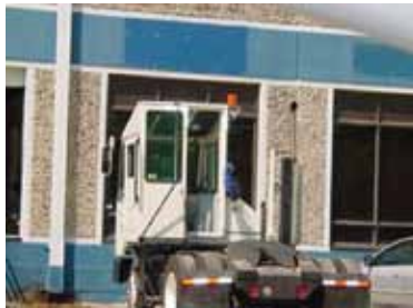
ODV Yard Tractor