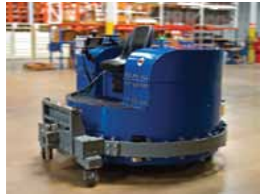
Boeing Electric ODV

For details and videos go to... www.hammondscos.com