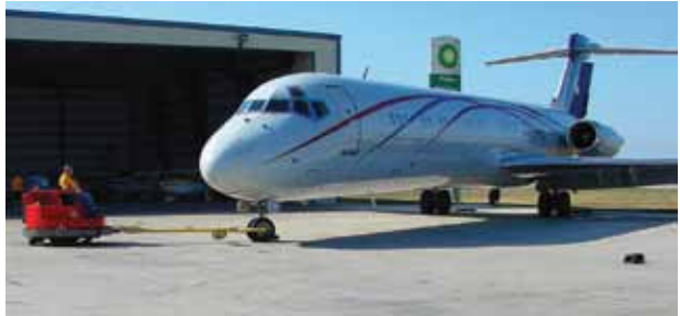
Towing DC-9 Aircraft